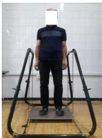
Figure 2. one form of the exercises